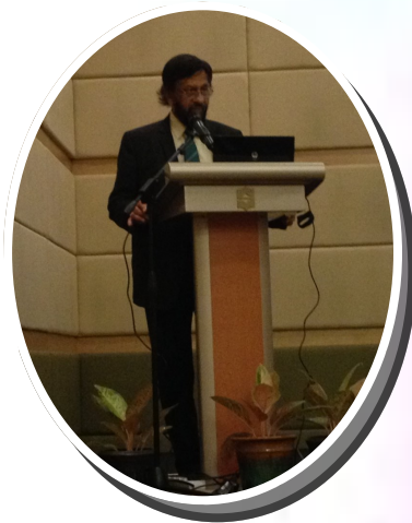
IPCC Chairman Rajendra K. Pachauri delivering his opening remarks

Speakers at the workshop included co-chairs of each of the IPCC's three working groups as well as authors specializing in topics such as forestry, sea-level change, food security and responses to climate change. The workshop also examined the role of the IPCC and how its work can be improved.