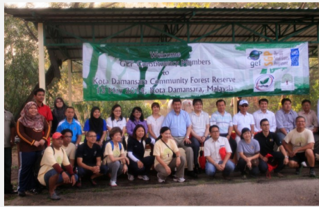
Sesi bergambar bersama KDCF semasa Site Visit di Kota Damansara

Grants Programme (SGP) di Kota Damansara Community Forest Reserve (KDCF). Setiap ahli constituency 5 di bawa meneroka kawasan hutan berkenaan secara berkumpulan yang diketuai oleh ketua projek KDCF.