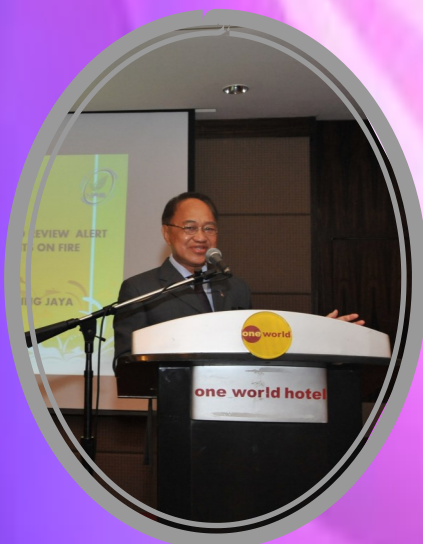
Kata-kata aluan daripada Timbalan Menteri Sumber Asli dan Alam Sekitar

Hasil laporan mesyuarat ini akan dibentangkan oleh Malaysia di Mesyuarat Ke-10 Conference of the Parties (COP-10) to the ASEAN Agreement on Transboundary Haze Pollution pada September 2014 untuk pertimbangan dan persetujuan.