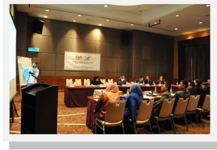
Sesi pembentangan oleh sekretariat GEF