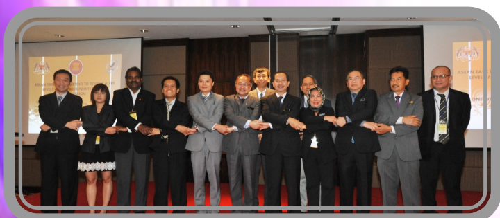
Barisan Ketua Delegasi Negara-negara ASEAN bersama Dengan Timbalan Menteri Sumber Asli dan Alam Sekitar