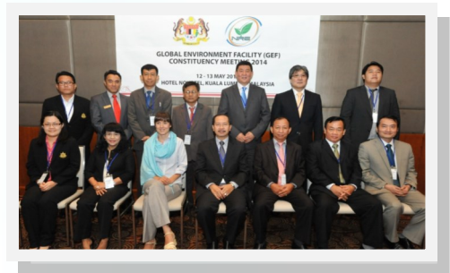
Ahli-ahli Constituency 5 yang menghadiri Mesyuarat GEF Constituency 5

Mesyuarat GEF bagi Constituency 5 terbahagi kepada 2 sesi dimana pada 12 Mei 2014 telah berlangsungnya mesyuarat ini bertempat di Hotel Novotel, Kuala Lumpur dan pada 13 Mei 2014 pula, satu sesi Site Visit telah diadakan